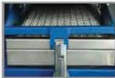
Handte EM Emulsion application