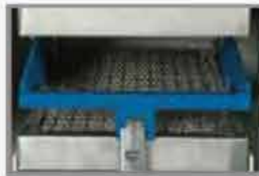
Handte OEL Oil Application